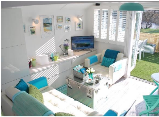
The interior of Salad Days